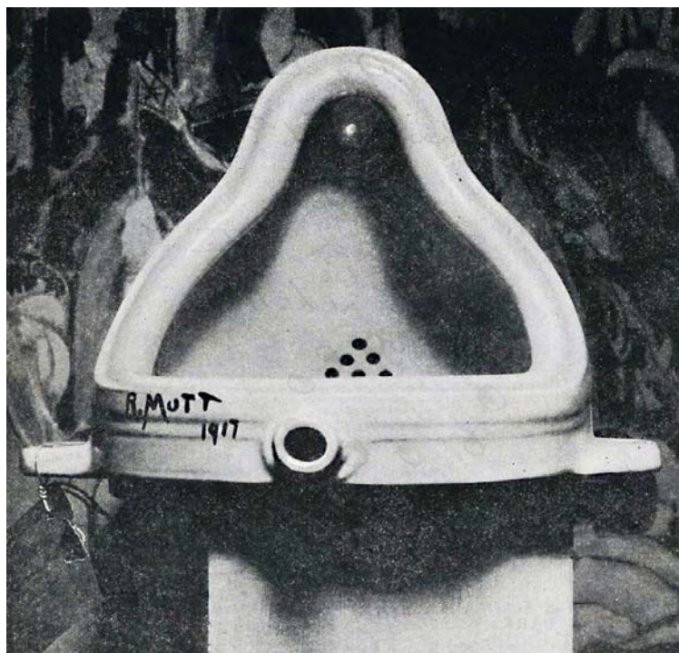
Marcel Duchamp, Fountain (1917)

art feeds on the sincerity it purports to reject. 161 If contemporary art needs the vernacular, why shouldn't the resale royalty right subsidize vernacular art?