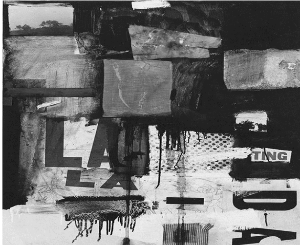
Robert Rauschenberg, Thaw (1958)

A “resale royalty right” or droit de suite (resale right) is a legal right that gives certain artists the right to claim a percentage of the resale price of the artworks they created. 4 The Berne Convention for the Protection of Literary and Artistic Works 5 and the Tunis Model Law on Copyright for Developing Countries 6 provide for an optional resale royalty right. Many countries have created a resale royalty right, although the particulars of the right differ from country to country. But the United States has repeatedly declined to create a federal resale royalty right, and a federal court recently held that a resale royalty right created by California is preempted by federal law. 7 However, the United States Copyright Office recently recommended the creation of a federal resale royalty right, and Congress has considered new bills to create such a right. 8