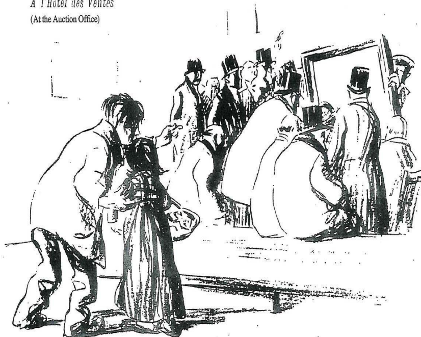
A l'Hôtel des Ventes (At the Auction Office)

artists shivering in an unheated Paris garret, suggesting that they deserved some form of support. 12